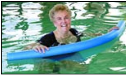
San Marcos Activity Center