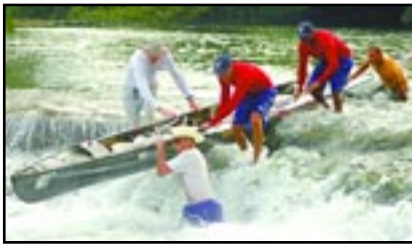
Texas Water Safari

Don't forget about the 25-meter pool located in the Activity Center where a variety of activities are offered including lap swimming, water aerobics and swimming lessons. The pool is open Mondays through Thursdays from 6 a.m. to 10 p.m., Fridays from 6 a.m. to 8 a.m. and Saturdays, 10 a.m. to 8