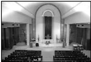
St. John's Catholic Church

The river is easily navigable, allowing a canoer to paddle down to Martindale from San Marcos — a pleasant day trip.