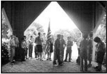
Historic Cemetery Chapel