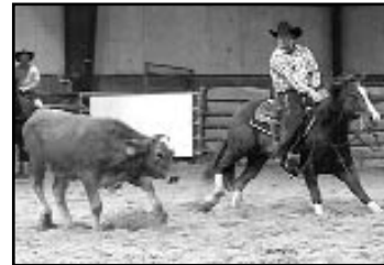
Hays County Civic Center

Some bats still roost in the towers at the Prime Outlet Center, and Austin's magnificent Congress Avenue Bridge colony is only a 30-minute drive away. The furry mammals leave roosts right after sundown in their nightly quest for insects and return before morning, having feasted on pests including mosquitos.