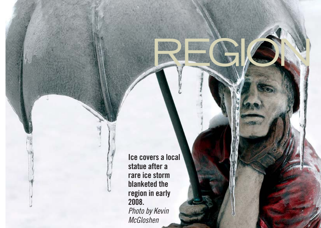
Ice covers a local statue after a rare ice storm blanketed the region in early 2008.