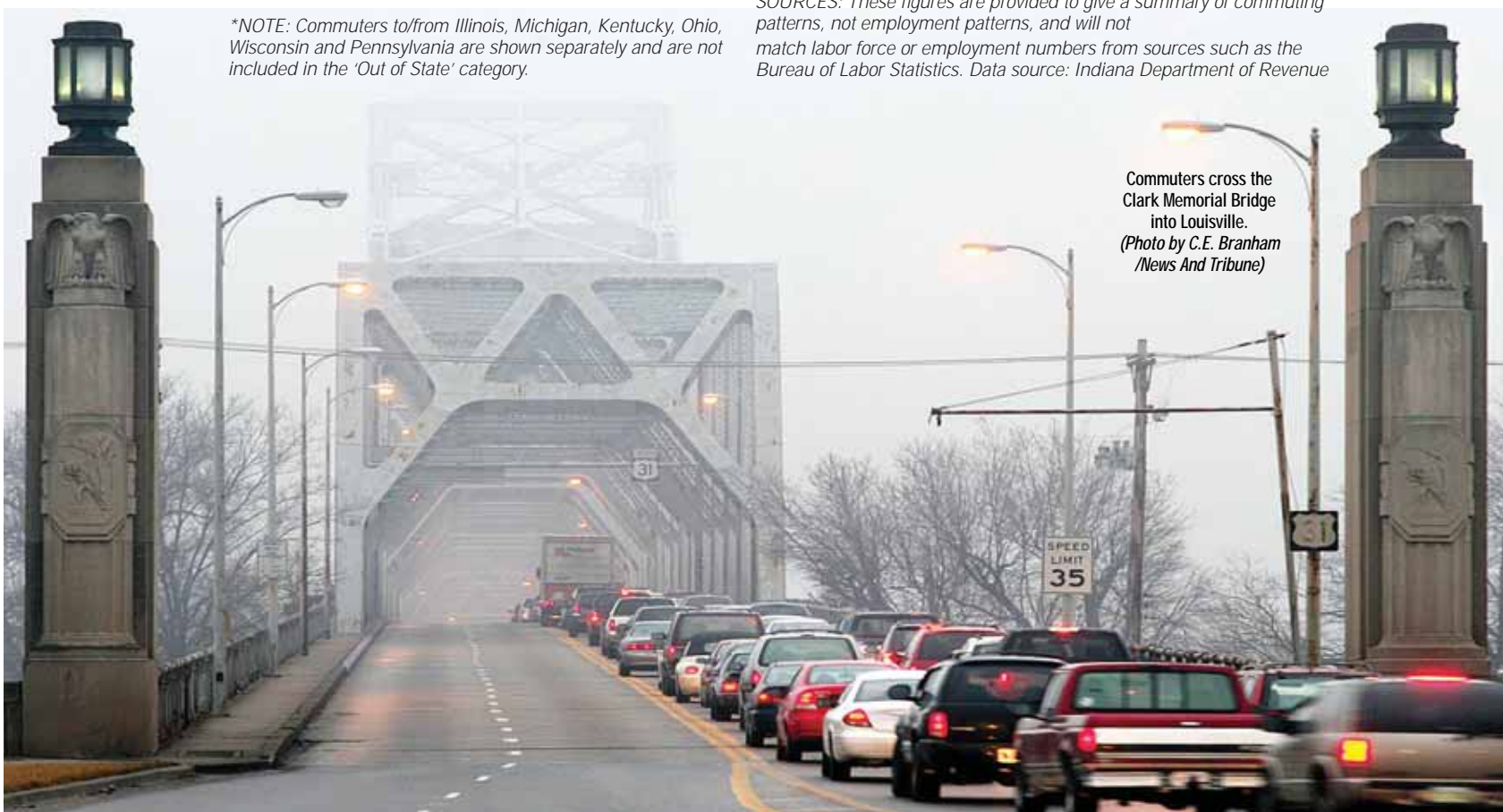
*NOTE: Commuters to/from Illinois, Michigan, Kentucky, Ohio, Wisconsin and Pennsylvania are shown separately and are not included in the 'Out of State' category.

SOURCES: These figures are provided to give a summary of commuting patterns, not employment patterns, and will not match labor force or employment numbers from sources such as the Bureau of Labor Statistics. Data source: Indiana Department of Revenue