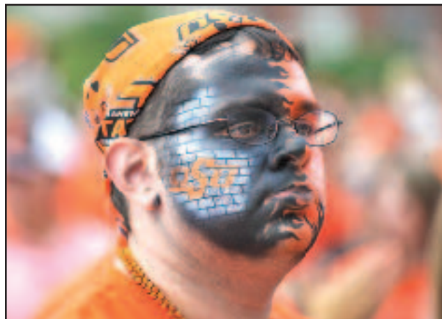
An Oklahoma State fan listens to the ceremonies for the re-dedication of the West End Zone.