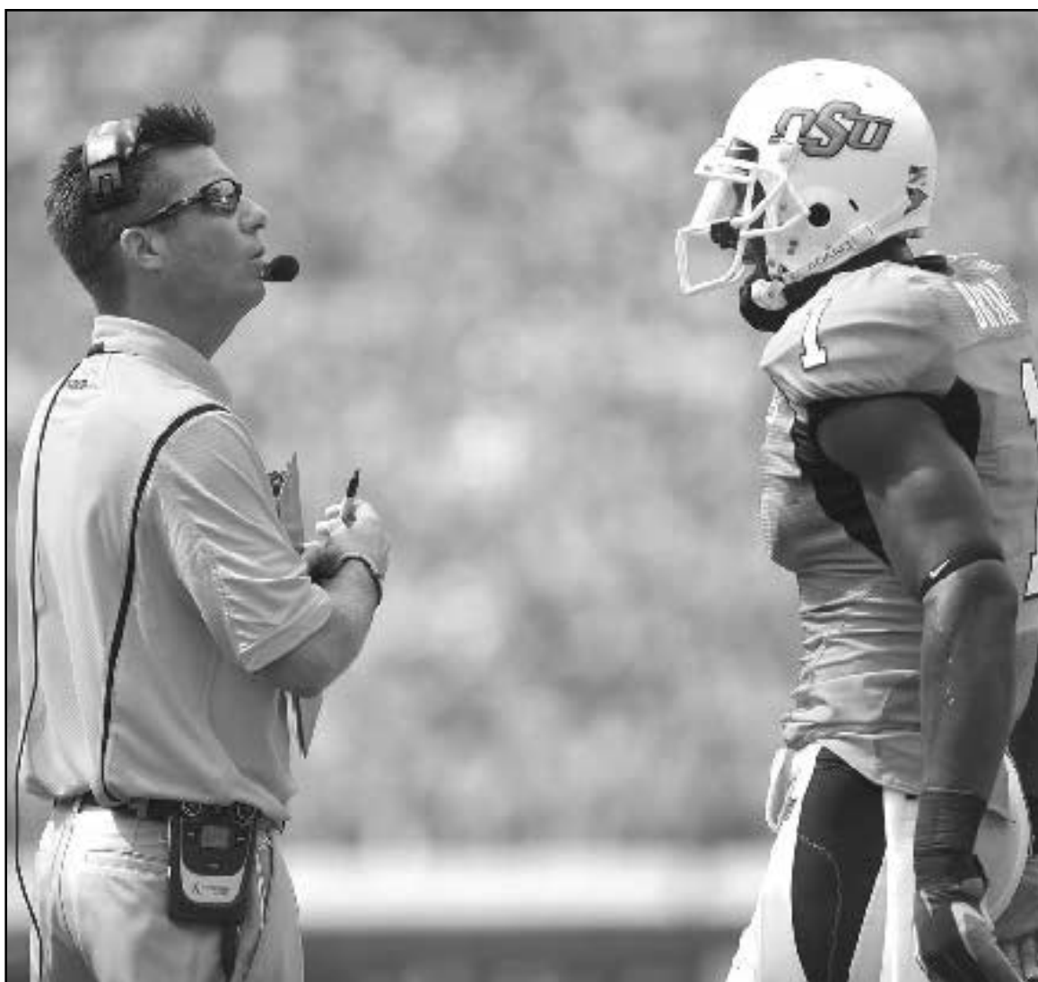
Oklahoma State coach Mike Gundy and wide receiver Dez Bryant talk during Saturday’s game with Georgia. Gundy saw his first playing time as a Cowboy quarterback in 1986 against the Houston Cougars, Saturday’s opponent.