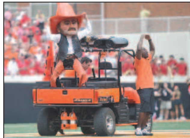
Pistol Pete helps get the Oklahoma State crowd going with a cheer before the game.