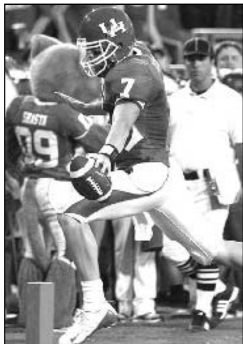
HOUSTON QUARTERBACK CASE KEENUM