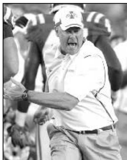
Iowa State coach Paul Rhoads will lead the Cyclones against rival Iowa on Saturday.

Yeah, right. Though Rhoads was clearly trying to keep things in perspective, he knows firsthand how important the annual Iowa-Iowa State game is to players, coaches and fans.