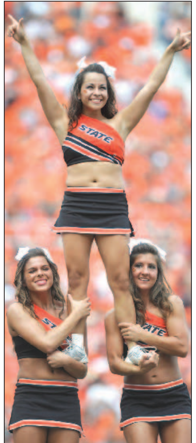
Members of the Oklahoma State cheer squad try to get the crowd fired up during Saturday's game.