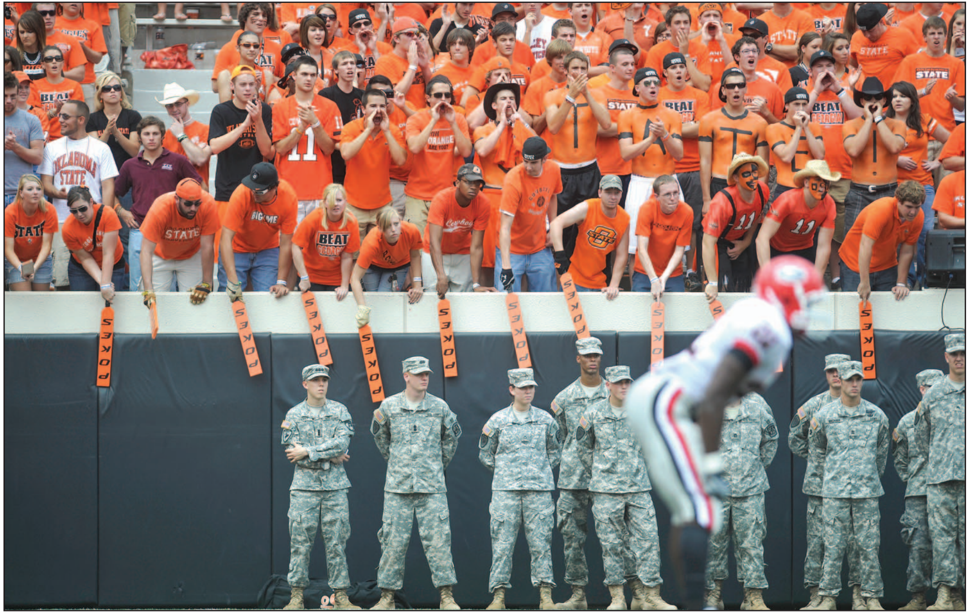
Oklahoma State fans cheer on their team, including the "Paddle People," during Saturday's game at Boone Pickens Stadium.