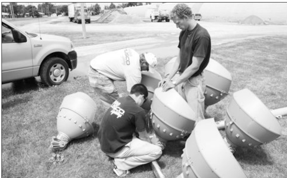
Team Install Help a Win/Win: Musco Team members assist area schools with volunteer installation to help cut project costs and to provide hands-on training for Musco members working with the product. Above, members assemble the New Sharon Little League system on-site.

Musco marked another year of growth for the Team in Oskaloosa and its offices worldwide. Demand for energy efficient products like Musco's Light-Structure Green™ continued to increase in 2007. Musco customer support services also expanded. As a result, employment growth reached 15 percent and renovation on the Musco campus moved forward to provide additional space.