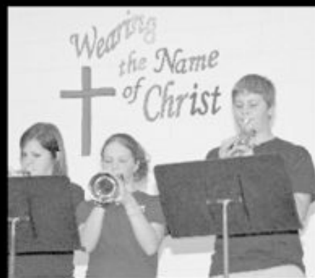
Wearing the Name of Christ