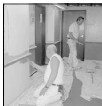
S&S Painting is putting a new color on our walls