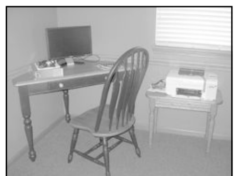
We have a new computer area for the residents