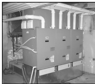
Single and Multiple Residential Furnaces