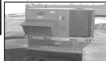
Rooftop Furnace/Air Conditioner Unit-various sizes and brands to fit your needs