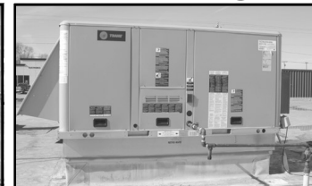
Rooftop Furnace/Air Conditioner Unit