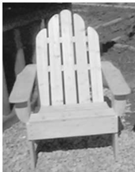
Solid wood Choice of wood and finish