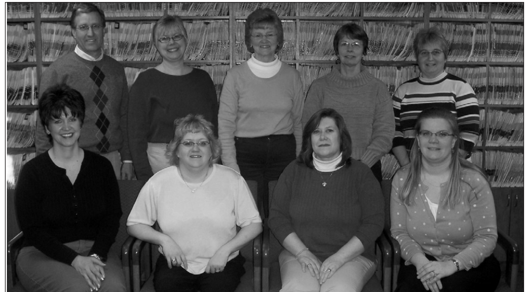
The staff at Oskaloosa Vision Center.