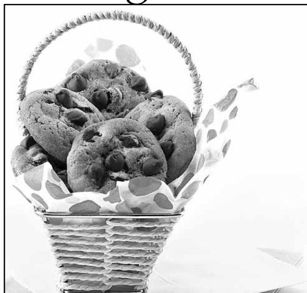
Edible wedding favors may include decorative cookie baskets featuring gourmet cookies from a favorite bakery.

It has become popular to have a self-serve candy bar at many weddings. Guests are invited to step up to the display and serve themselves from a series of dif-