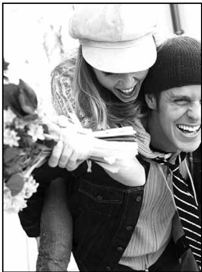
Engagement photos don't have to be posed portraits. Experiment with looks that fit your personalities for memorable photos.

When shopping around for a photographer, there are certain things couples should keep in mind. The first and most important is select-