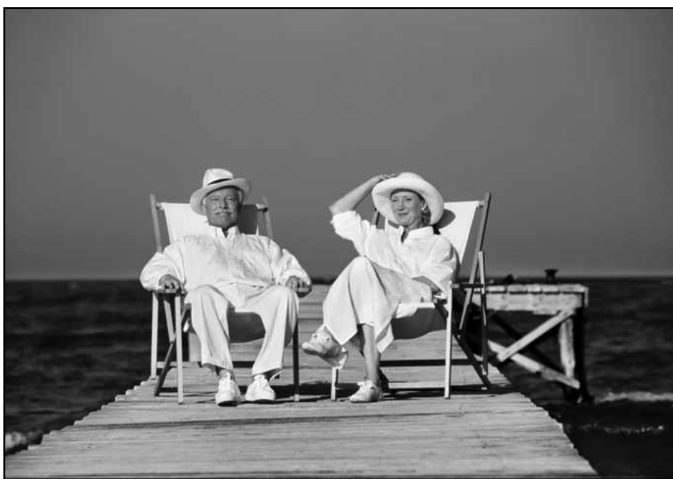
Couples who have stayed married for decades often put each other first and share a mutual respect.