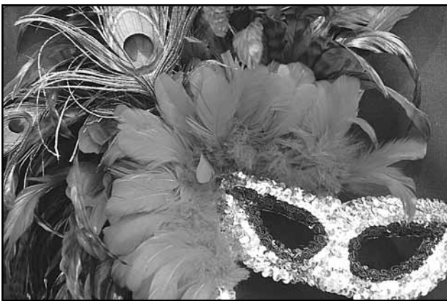
A masquerade theme might be an entertaining theme for a couple's nuptials.

• Holiday: The Christmas season lends itself well to wedding planning. The colors (red, green, gold) are already established, and most churches and buildings are already decked out in holiday finery, cutting down on the amount of flowers and embellishments couples need. Because the holiday season is so busy and a popular time for socializing, couples who want to tie the