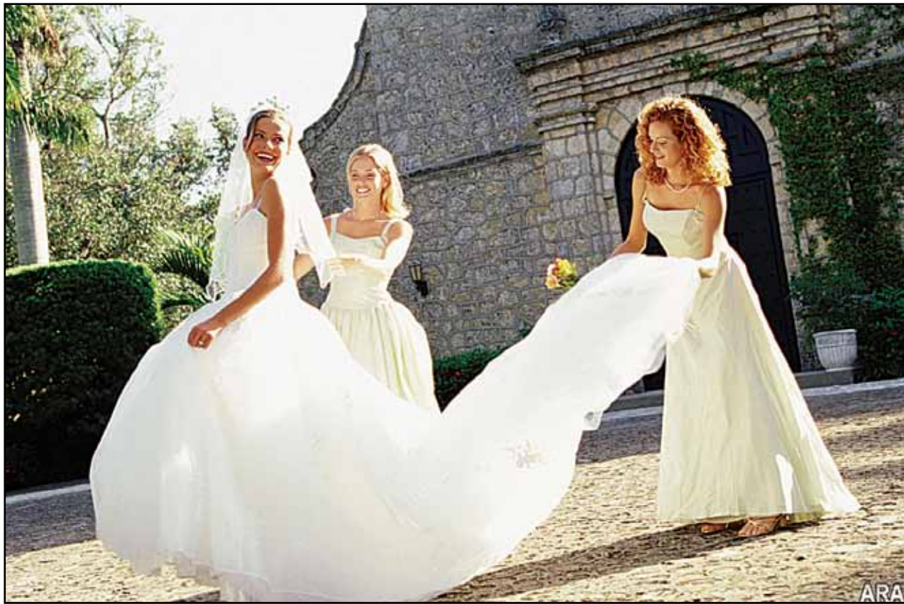
Many brides are now emulating the elegant lace gown worn by Catherine Middleton, now the Duchess of Cambridge